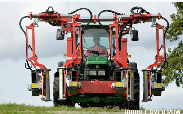
DOUBLE OVER ROW