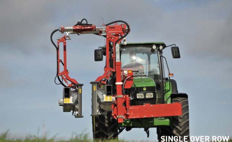
SINGLE OVER ROW